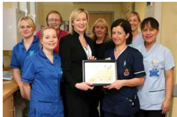
St Bernard's Ward 2009 Gold Standard Award Winners