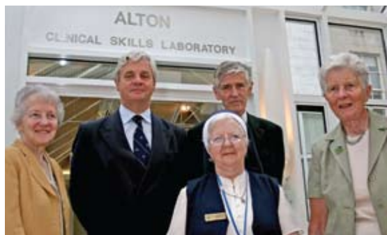
Minister for Health & Children, opens new Educational and Therapeutic Facility at the Mater.